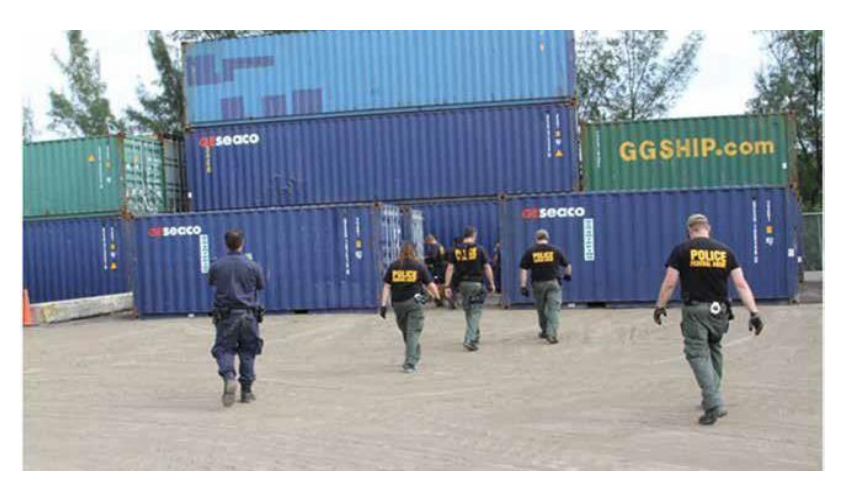
OEE Special Agents conducting inspections with U.S. Customs and Border Protection Officers

The Penalty: On June 9, 2021, Wu was sentenced to 52 months in prison (time served) and a $100 special assessment (suspended). In July 2022, Wu was deported from the United States. On December 1, 2022, BIS issued Wu a post-conviction denial order for a period of 10 years.