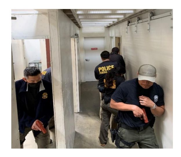
OEE Special Agents participating in a tactical training exercise

The Penalty: On June 17, 2021, USGoBuy, LLC agreed to pay a $20,000 civil penalty, $15,000 of which was suspended provided no violations occur during a three-year probationary period. In addition, a three-year denial of export privileges was imposed.