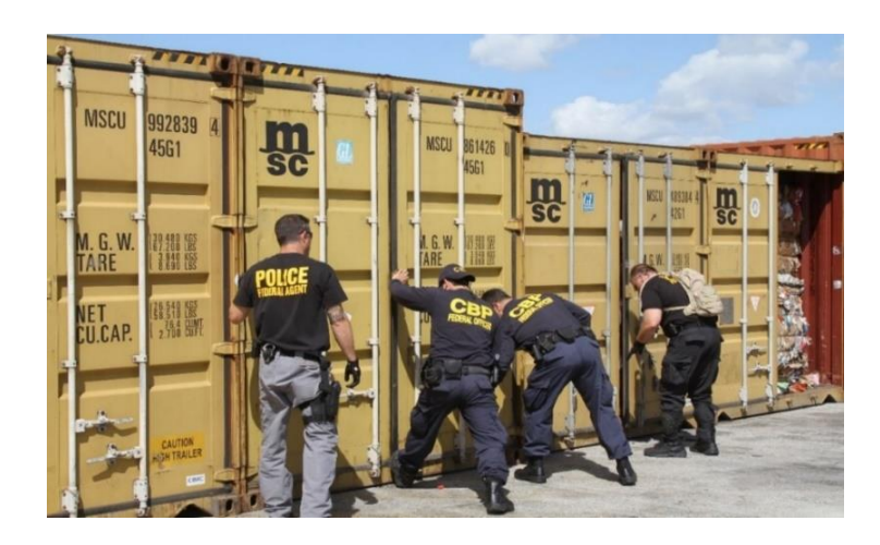
OEE Special Agents conducting an inspection

Fast-forward to the aftermath of September 11, 2001, and the focus of our country's national security efforts pivoted to face a new and pressing threat of the terrorist attacks on our homeland by non-state actors like al-Qaeda. The changing nature of the threat meant OEE, in addition to investigating proliferation of WMD and destabilizing military activities, also worked more closely with the Department of Defense to prevent U.S. components from getting into the hands of terrorists for use in improvised explosive devices. In parallel, we expanded the use of our Entity List to allow for the designation of parties when supporting any activity contrary to U.S. national security or foreign policy interests.