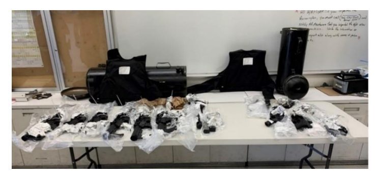
X-ray photo and photo of firearms concealed within air tanks, intercepted by Special Agents prior to their intended export