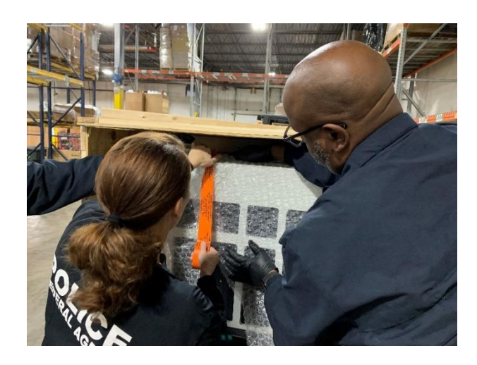
OEE Special Agents affecting a detention

The Penalty: On December 10, 2018, Yantai Jereh agreed to pay a $600,000 civil penalty. Additionally, a five-year denial of export privileges was imposed on Yantai Jereh, which was suspended provided that during the suspension period Yantai Jereh commits no future violations and pays the civil penalty, and eight additions were made to the BIS Entity List. A concurrent OFAC penalty in the amount of $2,774,972 was issued against Yantai Jereh and its affiliated companies and subsidiaries worldwide.