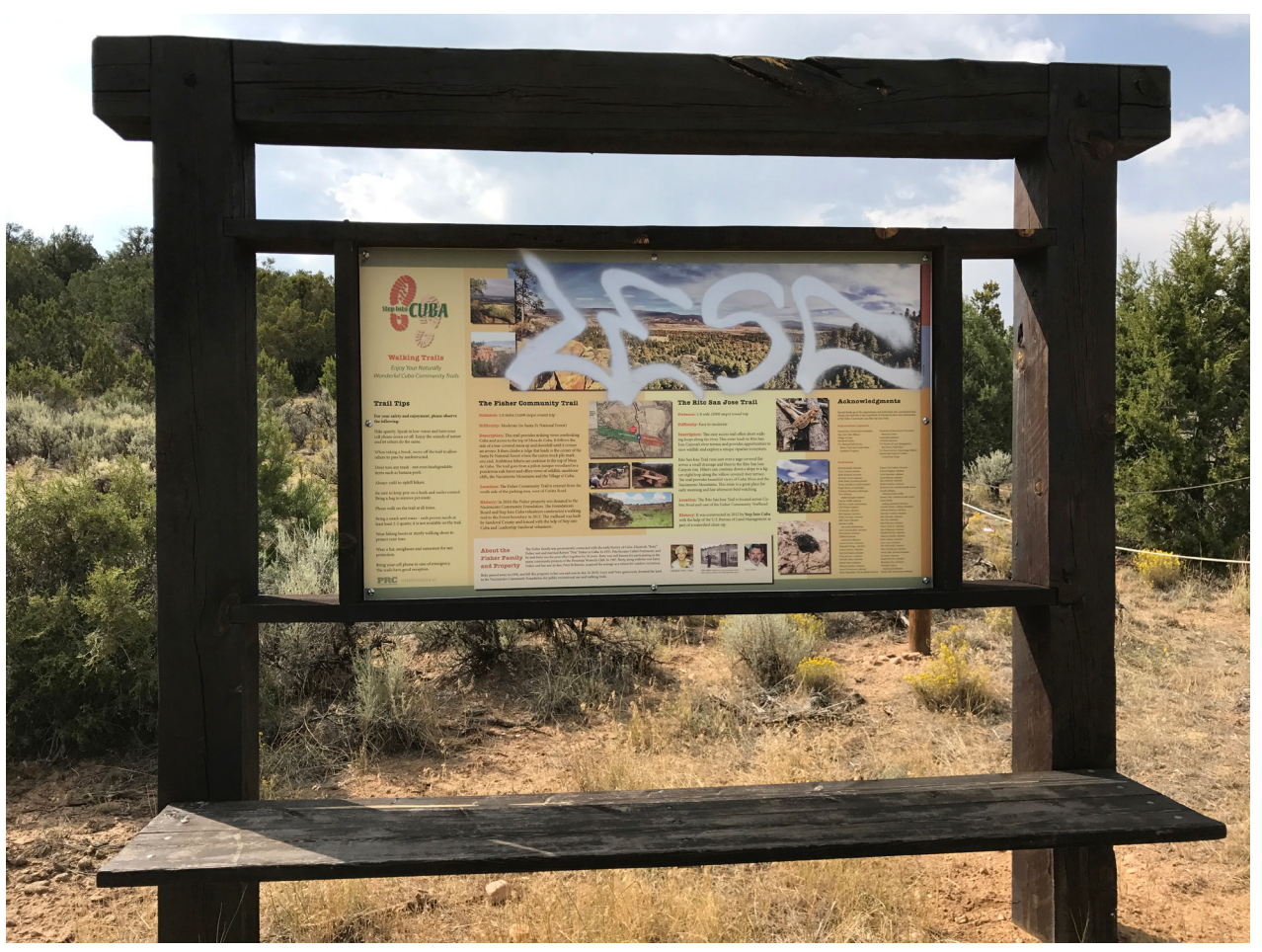
Fisher Trail Kiosk graffiti