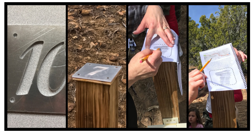
Post Topper, installed, rubbing, completed.