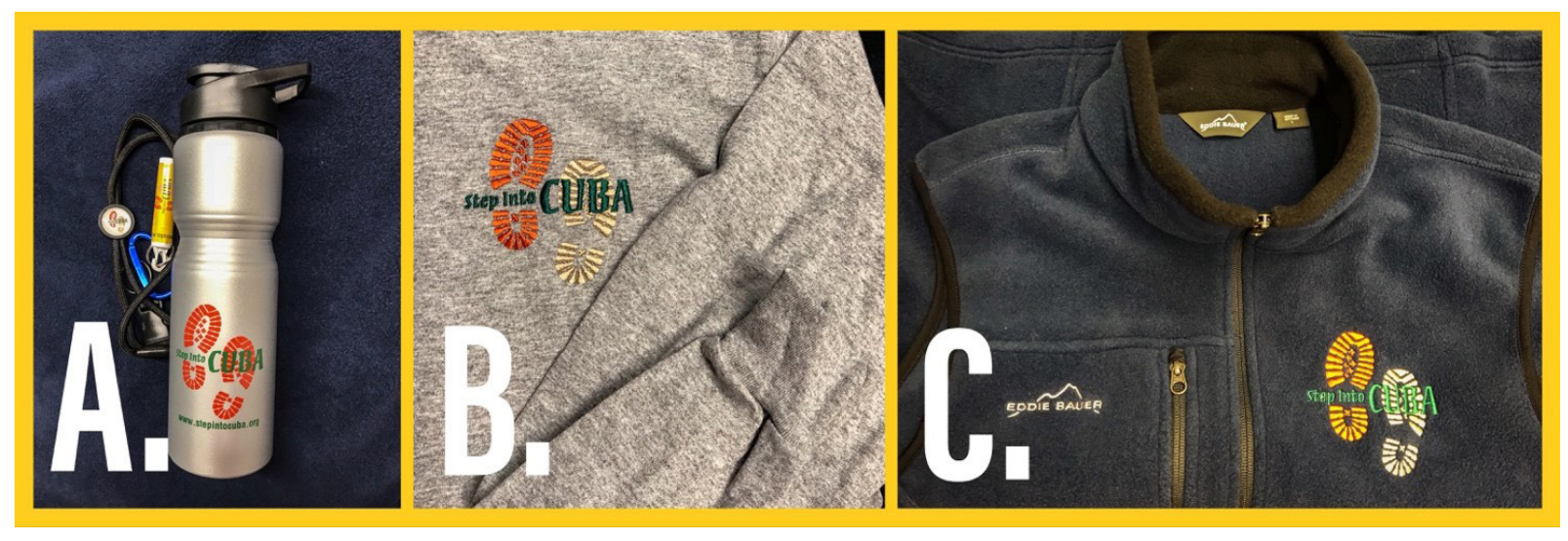
A: First trail completed - lanyard, lip balm & water bottle. B: 5 completed trails- long sleeve shirt. C: 11 completed trails – Eddie Bauer vest