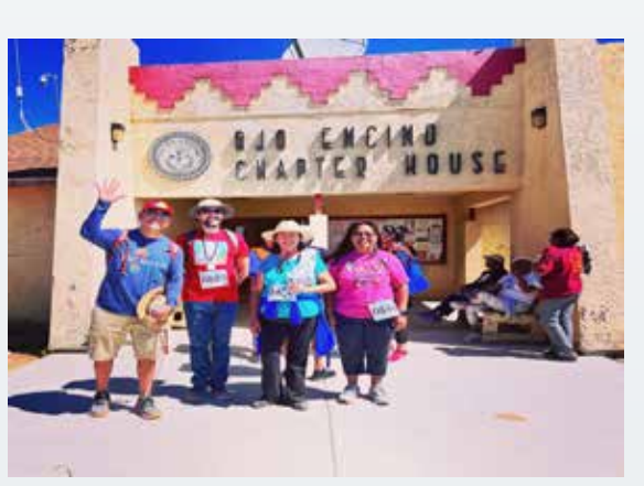
HP-HP team members & Cuba school staff participated in this event