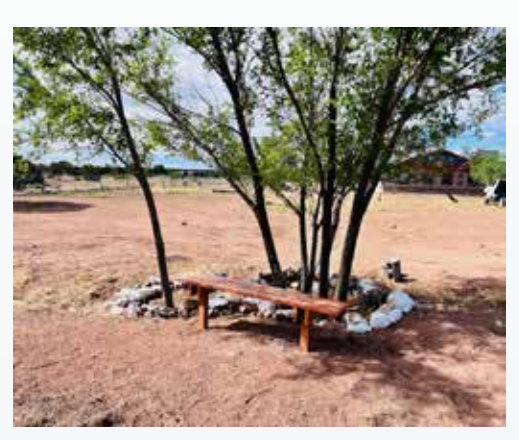
Summer student employees built benches