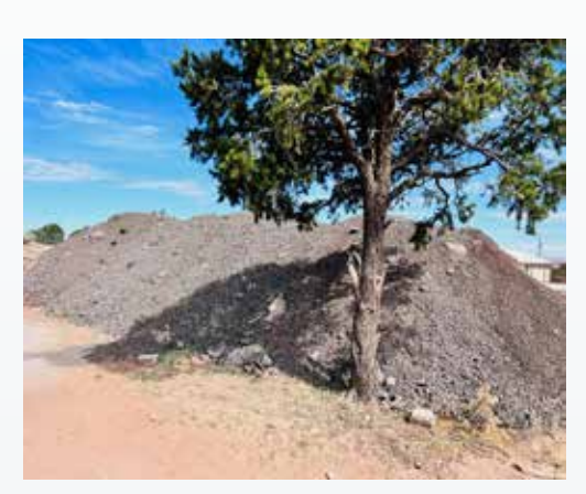
Donation from NM Dept of Transportation