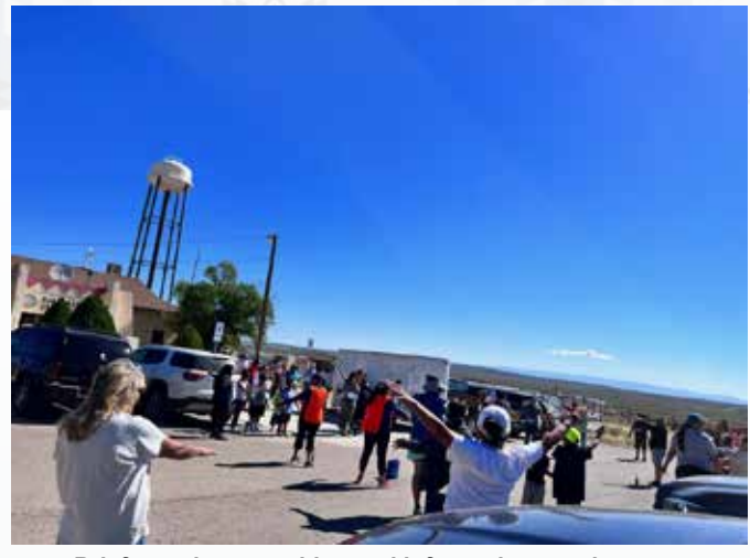
Brief morning stretching and information sessions

A successful event such as this one was a great way to showcase the beautiful trail that the community had created around the Chapter house. It is accessible, easy to walk, and has some gorgeous views.