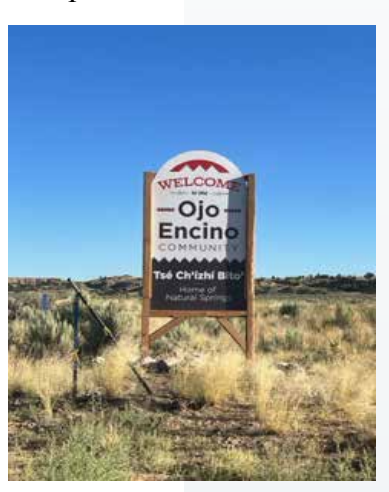
NEW Ojo Encino signs