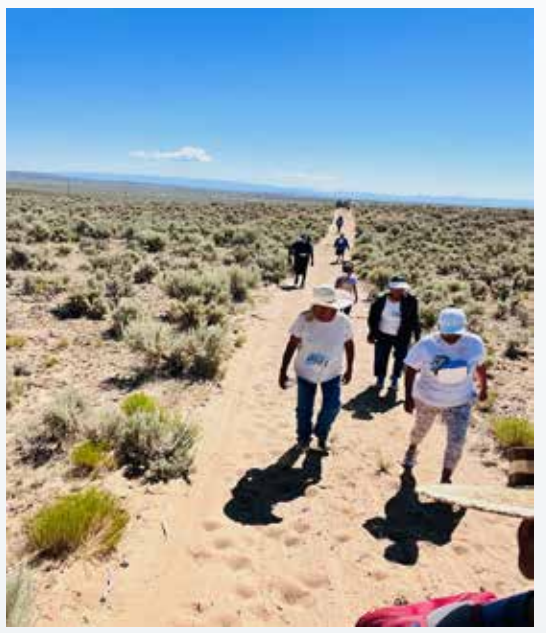
Beautiful Ojo Encino Trail walk