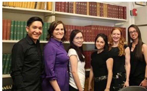
Our Residents 2015—2016