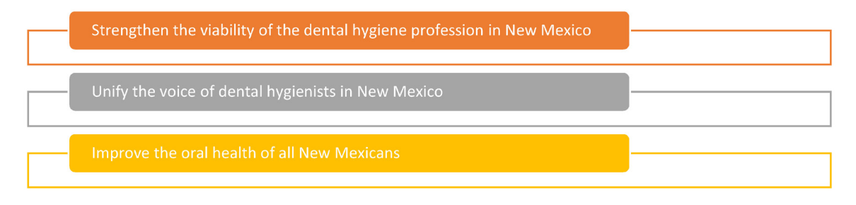
Figure 1: Strategic Initiatives

Another goal was to promote the professional socialization of dental hygienists across the state. This initiative brought dental hygienists together to share their thoughts and visions so that a unified voice for dental hygiene could be developed and promoted. This unified group collectively developed strategic initiatives to advance dental hygiene and promote the use of dental hygienists within all health systems in New Mexico. For this reason, the symposium provided keynote presentations to present the historical perspective and describe the current system and projected trends in dentistry. The Executive Director of the New Mexico Dental Association also provided input from dentistry.